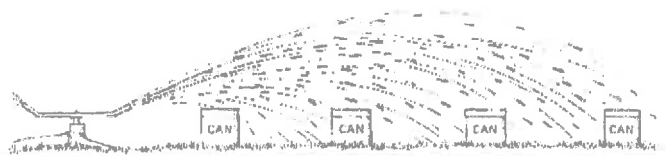
This measures the rate of application and distribution uniformity.

The amount of water to apply at one time depends largely on the soil. The type of soil determines how much water is absorbed and held in addition to the potential rooting depth of the grass. Apply enough water to soak soil slightly below the root depth. You can determine this by excavating a small portion of the soil profile with a shovel. Most roots grow 6 to 8 inches deep in a loam soil, deeper in sandy soil, and shallower in a clay soil. Roots will not grow as deeply in compacted soils because of a lack of oxygen.